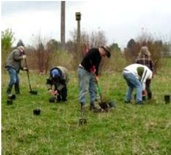
Chilliwack Field Naturalists planting native species

The Foundation is required by law to disburse a prescribed portion of its income to other registered charities. It undertakes no programs itself. It concentrates its efforts on building a strong and flexible financial base for the future initiatives of BC's naturalists. Over the past 20 years we have provided funds in support of BC Nature projects, including BCnature magazine, projects of member clubs throughout the province, and a variety of conferences.