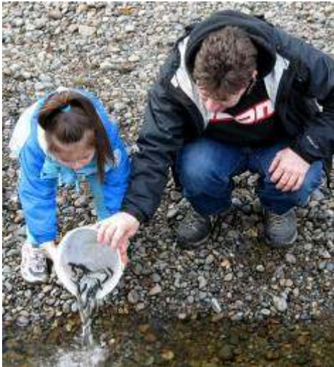
Releasing salmon fry on the Little Campbell River

The BC Naturalists' Foundation continues to support BC Nature and BC Nature club projects to restore natural areas and to help communities better connect with nature. As investment earnings improved by the end of 2009, the Foundation was able to make a grant to BC Nature early in 2010, and BC Nature disbursed $2,000 to the Comox Valley Naturalists for ongoing wetland restoration and $2,000 for production of BCnature magazine. By the end of 2010, the Foundation was able to contribute a further $6,000 in grants to BC Nature clubs, bringing its total grant in 2010 to $10,000.