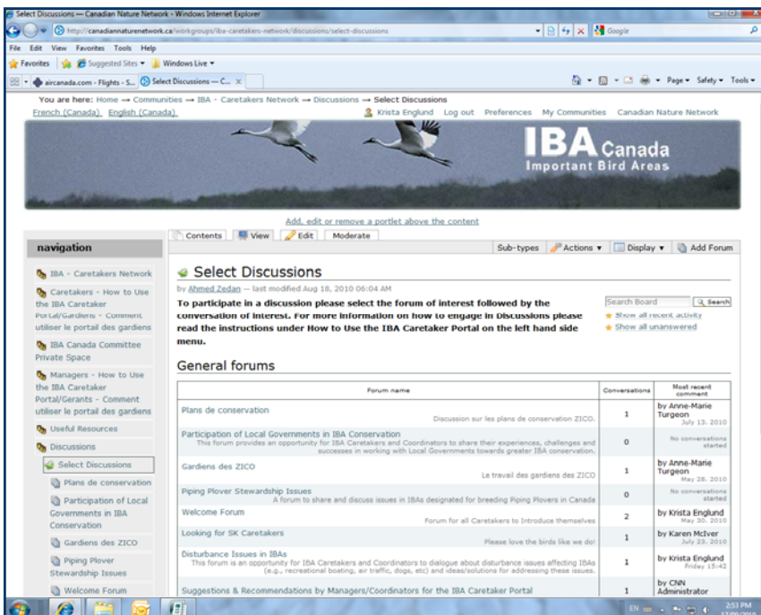
Figure 4. The portal makes it easy to communicate with Caretakers across the country. Through the discussion forums, Caretakers can learn from each other and share their experiences, successes and frustrations with other Caretakers. Current forum topics include disturbance issues at IBAs and involvement of local governments in IBA conservation—and there is room for many more.

available for BC Caretakers, including the Caretaker Manual, previous presentations and articles about the IBA program, and the IBA newsletters & brochures. Using a previously written article or presentation as a template may help Caretakers develop communication materials for their own IBAs—and save valuable time! More examples of signs, posters, and photos will be added as they become available. Caretakers are encouraged to email example materials to the IBA coordinators so they can be posted on the portal. Accessing useful resources from other provinces is also possible for Caretakers who are interested to see how other provinces are managing.