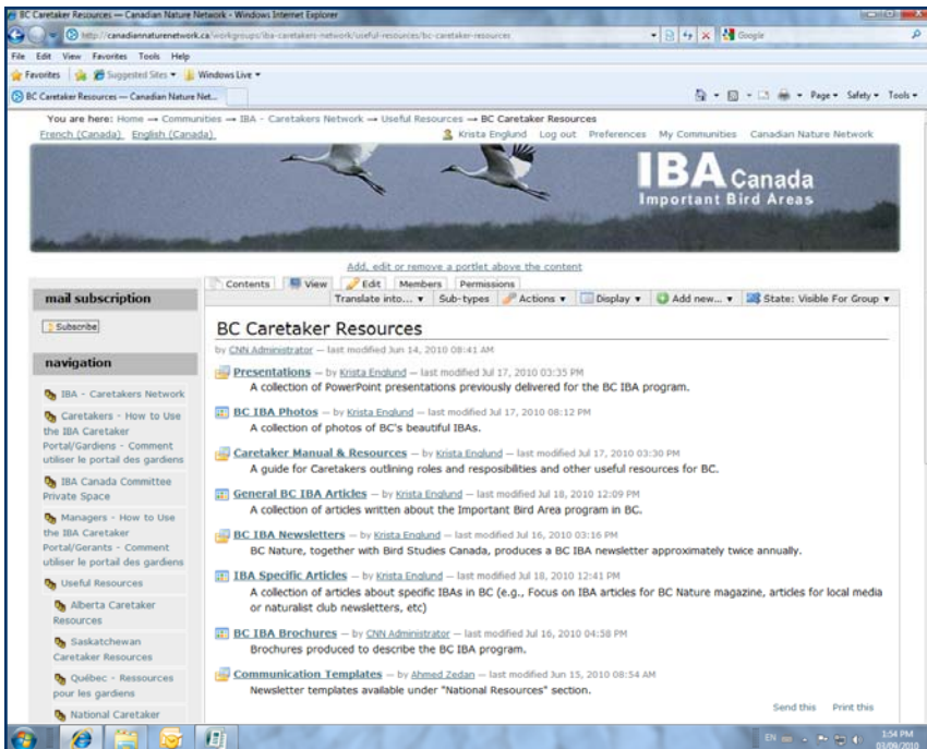
Figure 3. The portal is a one stop shop for a variety of useful resources for Caretakers—from previously delivered presentations or previously written articles that can be used as a template for future presentations or articles, to the Caretaker Manual, newsletters, brochures, example signs, posters, etc.