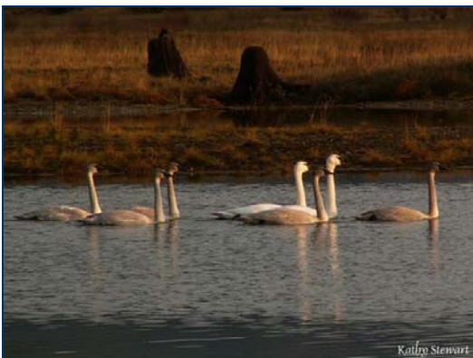
Swans on the Chehalis River in the fall.