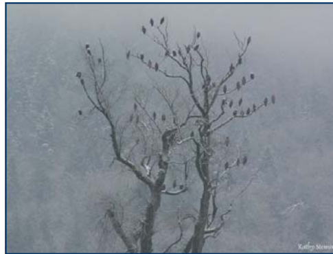
Fifty Bald Eagles gathered on a cottonwood tree.

During the festival, many exciting venues offer excellent eagle watching opportunities and a range of activities and adventures from Mission to Chilliwack (e.g., jet boat eco-river tours; a Chehalis River walking tour; environmental presentations, naturalists and interpreters; historic and ancient aboriginal sites; displays by local artists; and lots of hands on activities and entertainment). Most of the festival is free as costs are covered by festival sponsors, grants, and the hard work of countless volunteers. Tickets are required to attend some workshops and presentations. If you are thinking of attending this year, be sure to check out the FVBEEF website at www.fraservalleybaldeaglefestival.ca for more information on the various sites included in the 2010 festival.