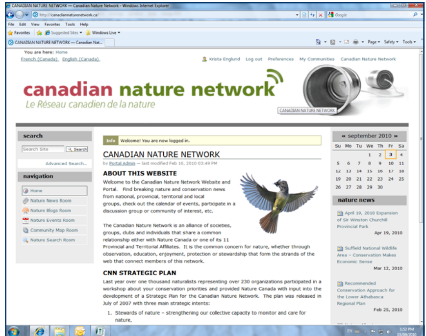
Figure 1. The Canadian Nature Network website ( www.canadiannaturenetwork.ca ) houses an exciting new communication tool called the IBA Caretaker's Portal.

Accessing resources for the BC IBA program will be as easy as a click of a button. As shown in Figure 3, there are already a variety of resources